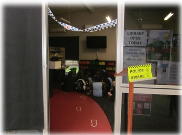
The intrigue started at the door