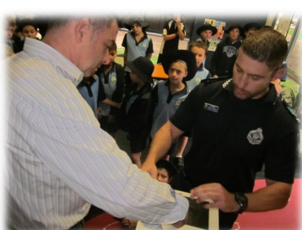
A possible suspect was finger printed