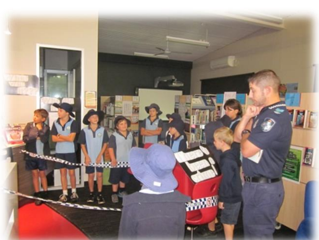
The Police were involved