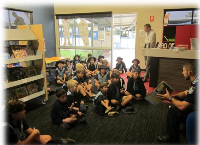
The students were asked to help